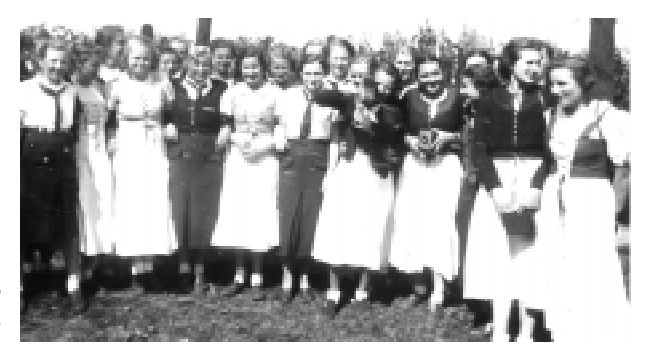
German 'girl guides'